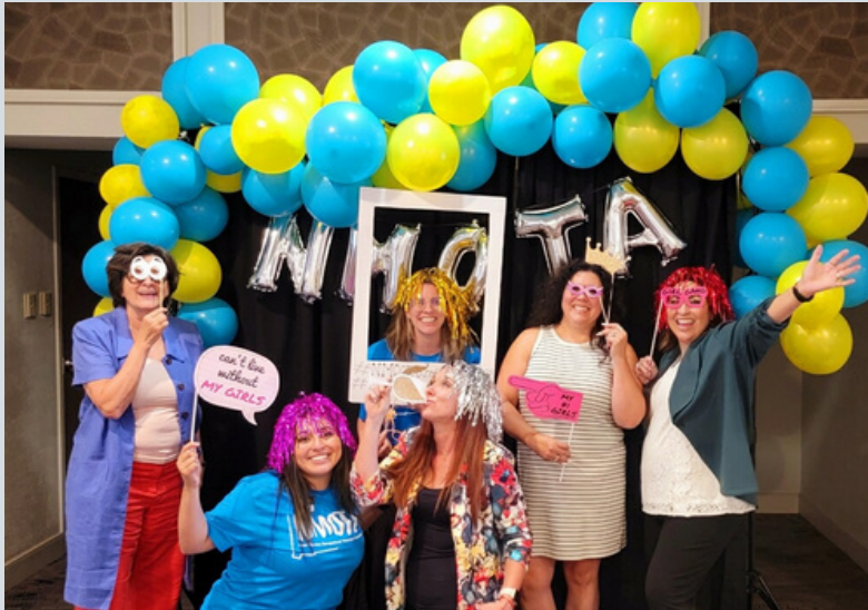
PICTURED: OT'S AND OTA'S AT CONFERENCE