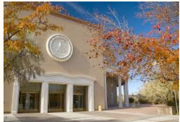
ROUNDHOUSE, SANTA FE, NM

The 2024 Legislative day will be offered as a part virtual and part in-person event. The virtual event will be online CEUs (free to members) that focus on ways that all OTs and OTAs can participate in legislative advocacy from all corners of the state. We will Also continue the tradition of going to the Roundhouse to educate and advocate to our state legislators and the public about the distinct value of OT. Occupational Therapy Day at the Legislature will grow awareness of what Occupational Therapy is and how we benefit the clients we work with across New Mexico. Last year, students from the university of New Mexico and Eastern New Mexico University-Roswell and community practitioners participated in advocating for Occupational Therapy in-person at the Roundhouse and online. Students and community practitioners spent time talking to their legislators and sending letters advocating for Occupational Therapy. Although inclement weather did not allow many people to attend the event in-person, the event was still successful. Thank you to everyone who participated this year. We look forward to seeing you all again early next year.