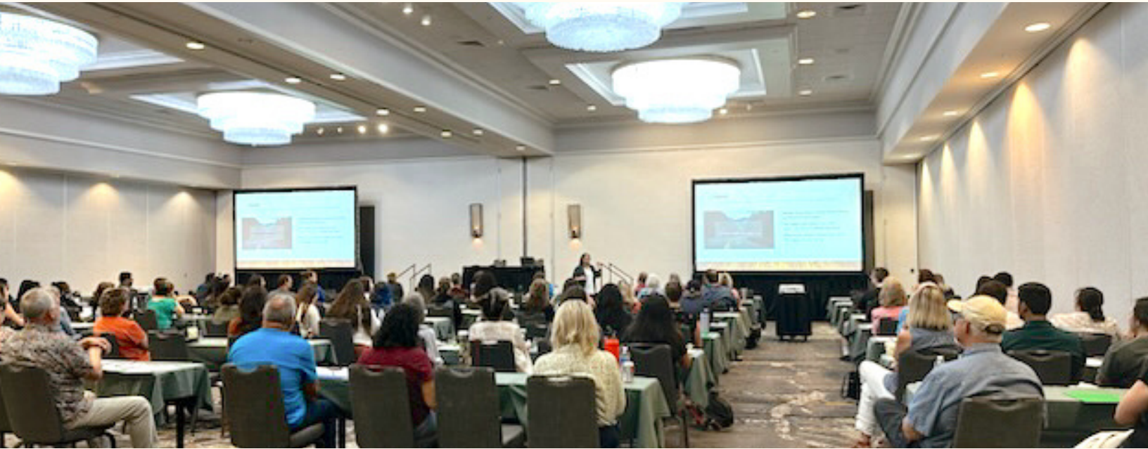
PHOTO FROM 2023 CONFERENCE

We extend an invitation to all members interested in sharing their knowledge in occupational therapy, be it across the state, in conferences, continuing education, professional development, meet & greets, NMOTA representation, and more. Your voices are powerful, and advocating for your profession is a responsibility we all share. As we look ahead, there are several areas of concern and topics of discussion that deserve our attention, including Diversity, Equity, and Inclusion (DEI), the OT Compact, advocacy in insurance and with third-party payers, exam updates, Legislative Day, and the National/State Conference. We want to express our heartfelt gratitude to each and every one of you who contributes to this wonderful team, volunteering your time and expertise to make the profession and NMOTA flourish. Together, we are making a difference, and we are excited about the journey ahead. Thank you all for your dedication and passion for the occupational therapy profession.