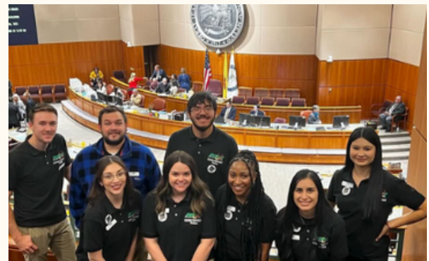
PICTURED: ENMU STUDENTS LEGISLATIVE DAY 2023