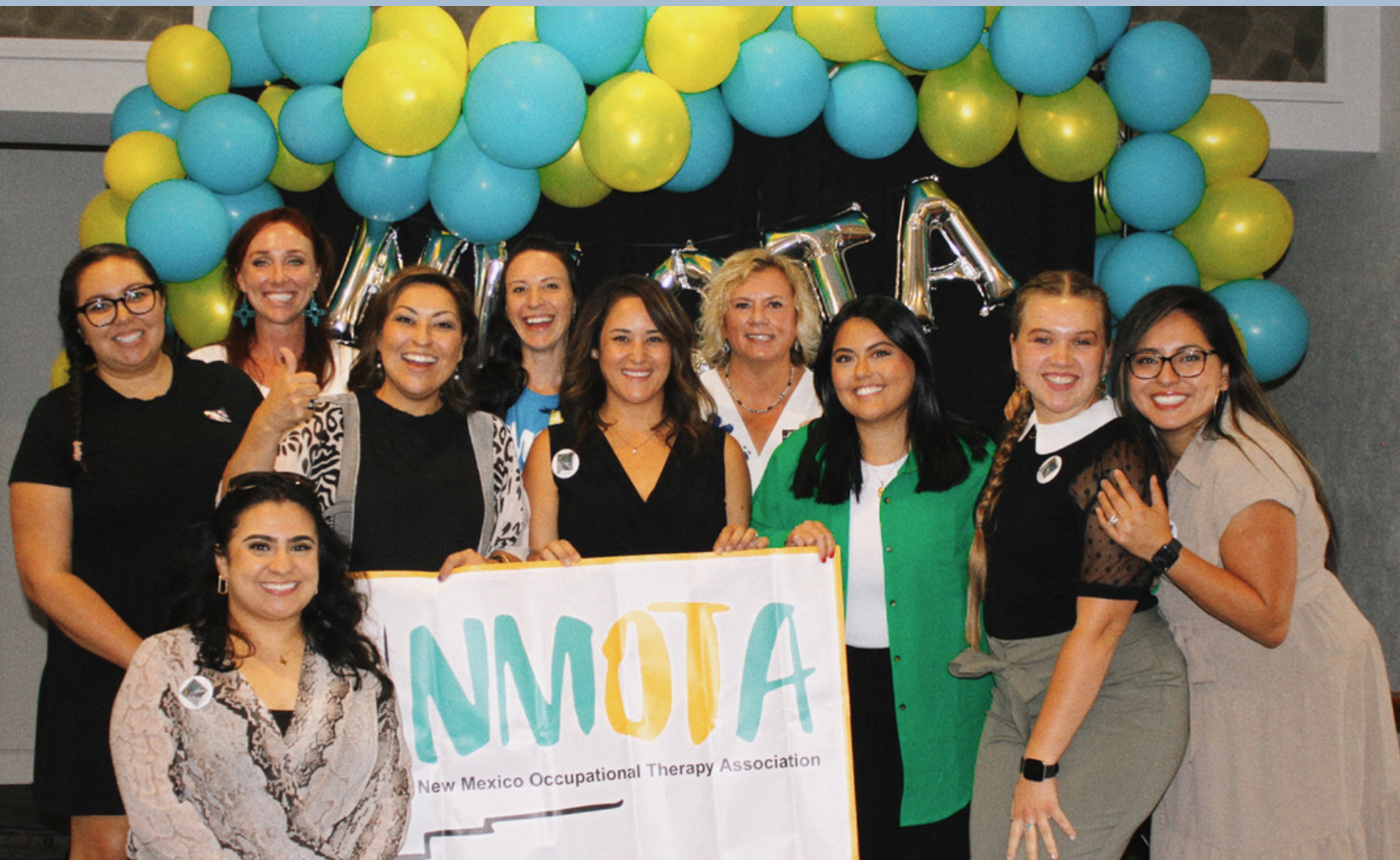
PICTURED: NMOTA BOARD MEMBERS AT CONFERENCE