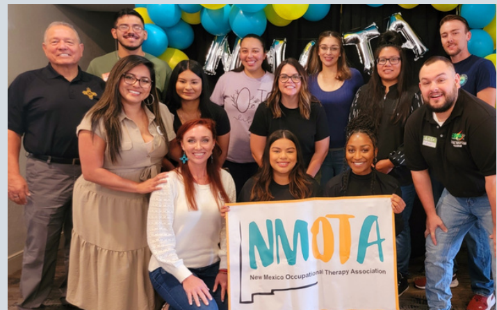
PICTURED: ENMU STUDENTS AND FACULTY

While hosting conference is a highlight of our year, it is also costly. That is why we are exploring various venues and ways to make next years conference more cost effective as well as time efficient for everyone.