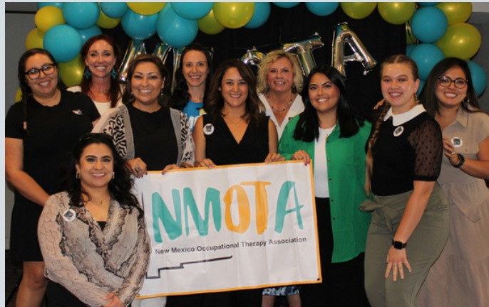
PICTURED: NMOTA BOARD MEMBERS